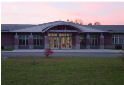
TVEMS at Daybreak